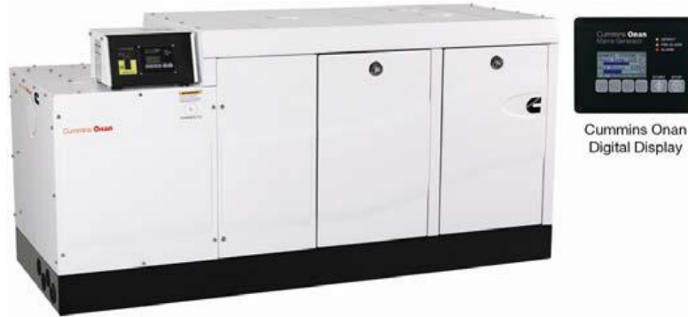
Cummins Onan Digital Display