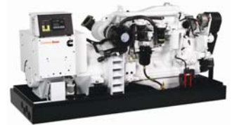
Standard model without sound shield