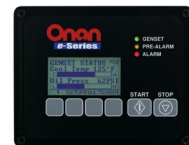
e-Series Digital Display