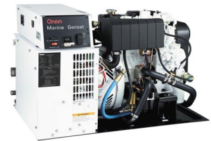
Standard Model without Sound Shield Shown