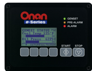
e-Series Digital Display