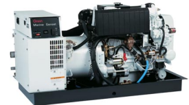
Standard Model without Sound Shield Shown.