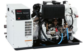
Standard Model without Sound Shield Shown.